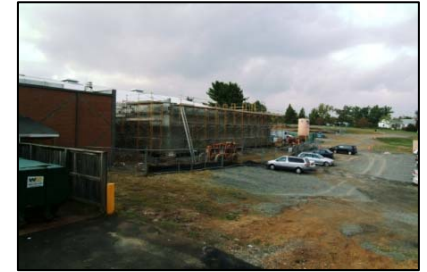
Current Construction Conditions